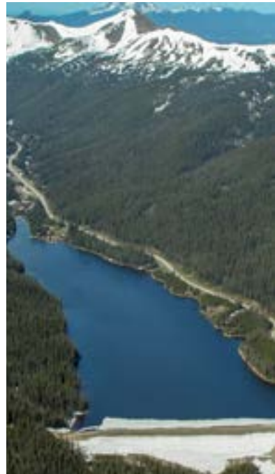
Joe Wright Reservoir which stores water that is diverted from the upper Michigan River Watershed to the Poudre River Watershed via the Michigan Ditch.

Learn more about our Watershed Program and source water monitoring efforts, including seasonal updates, annual and five-year reports at fcgov.com/source-water-monitoring .